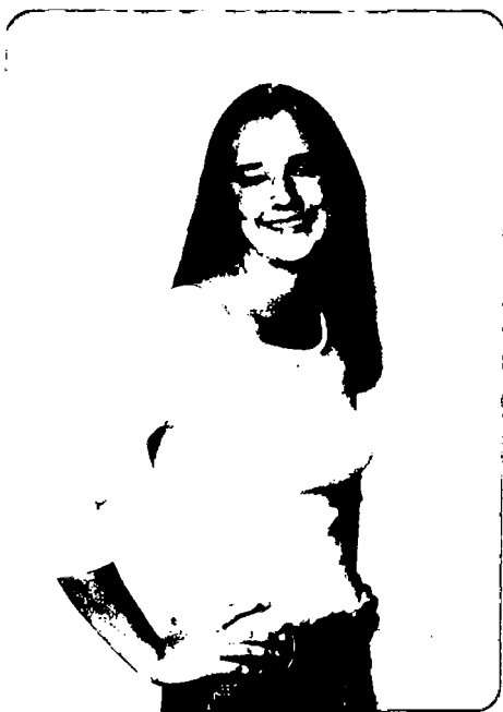
Joanna Rubick KSDAR Scholarship