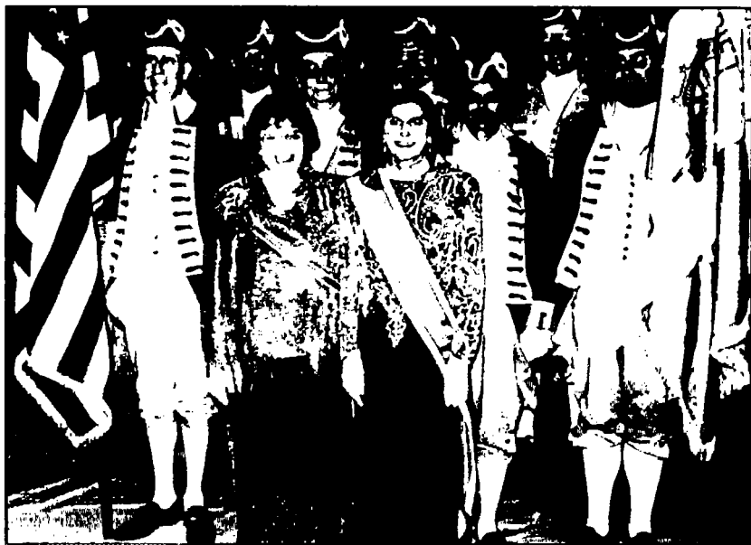
STATE REGENT AND PRESIDENT GENERAL WITH KSSAR COLOR GUARD