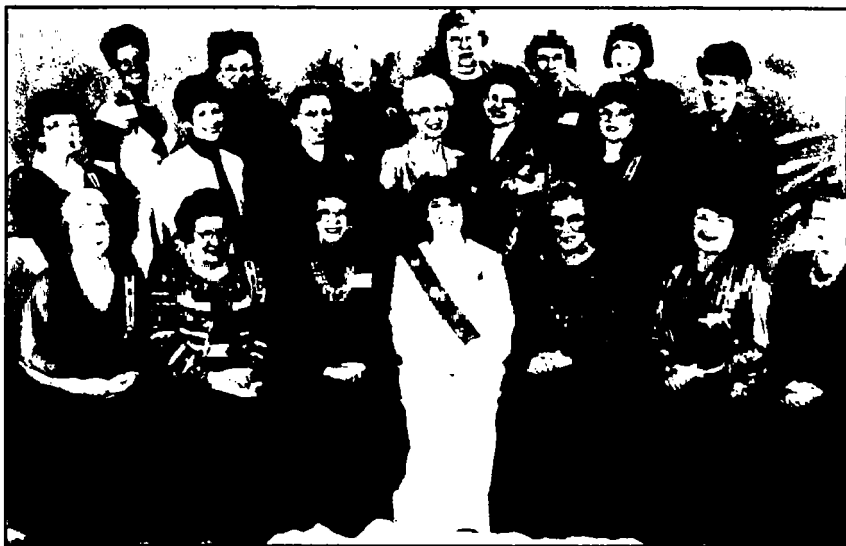
1992-1995 KSDAR STATE CHAIRMEN