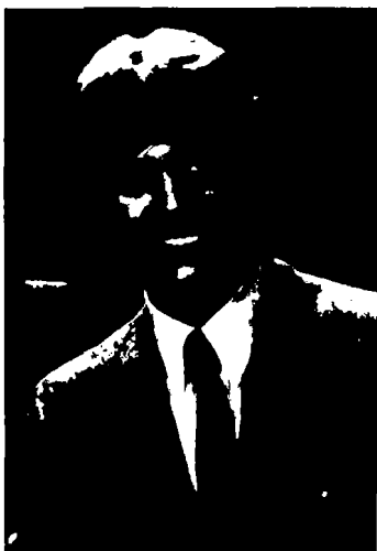
Tim McGlasson Pendleton Scholarship