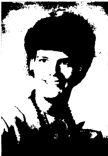
Carmen Day KSDAR Scholarship