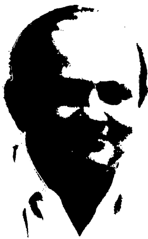
Tom Jensen Outstanding Teacher Award 1986