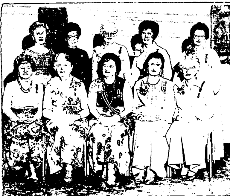
KSDAR EXECUTIVE BOARD