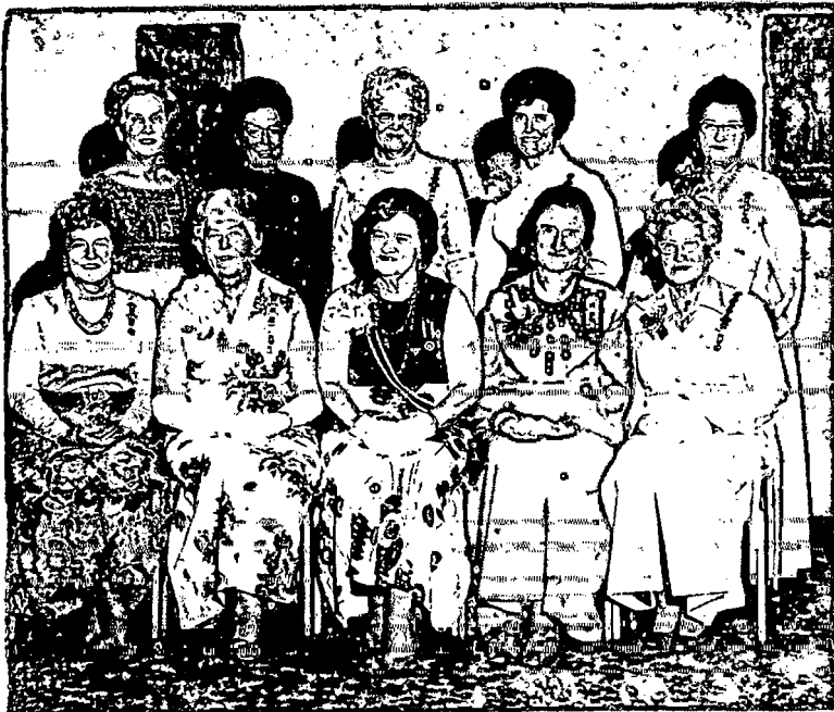
KSDAR EXECUTIVE BOARD